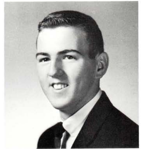
David Crockett Key Club President