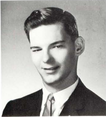
Warren Cole Charles Palmer Davis Award